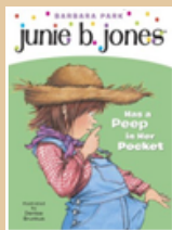
J SHORT CHAPTER PARK B