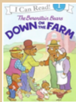
J SHORT CHAPTER BERENSTAIN S