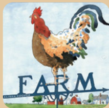
J PICTURE COOPER E