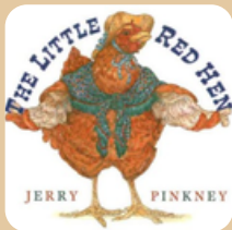
J PICTURE PINKNEY J