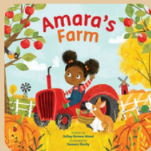
J PICTURE BROWN-WOOD J