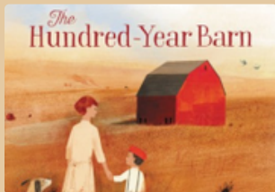
J PICTURE MACLACHLAN P