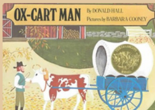
J PICTURE HALL D