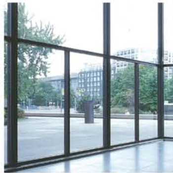
2 storefront system - black anodized aluminum