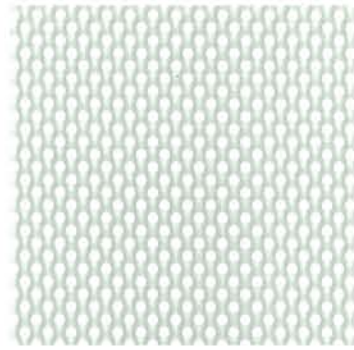
1 transom glazing - silkscreened 1/8" white dots