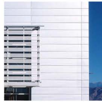
3 entry shroud - Centria "silver" metal cladding