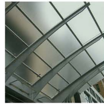
4 canopy - 3form "glass green" with stucco finish (alternate: laminate glass) steel columns painted to match entry shroud material