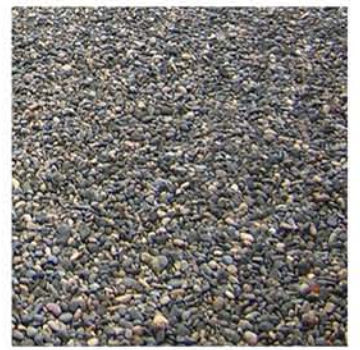
5 ballasted roof - to match existing